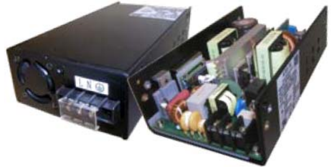
PSRL5016U4 Series: (U-Chassis): 7(L) x 4(W) x 2(H) inches PSRL5016E4 Series: (Enclosed with built-in fan): 8(L) x 4(W) x 2(H) inches